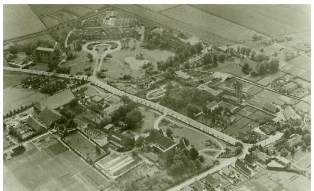
Wagenborgen from the air, 1946.

Patrols from the 7th Canadian Reconnaissance Regiment determined that Wagenborgen, a short distance from the centre of the battalion's line, was still held by an unknown number of Germans. "D" Company was ordered to take the village in a one-company attack in the early hours of 21 April.<sup>7</sup>